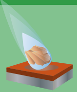
Particle Hits Substrate