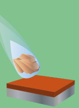
Water Encapsulated Media